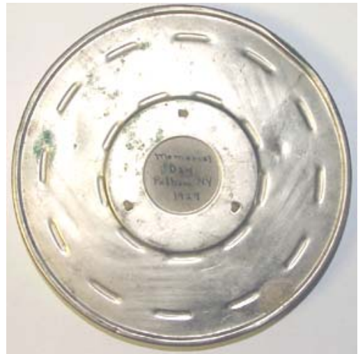
Film Canister Containing the Film "Memorial Day, Pelham, NY 1929"