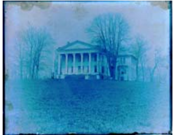
The Marshall House at Pell's Point. Glass Photographic Negative Created by W. Montgomery on April 21, 1923.

The glass negatives are significant. Because they were created by a Town Historian, many of the photographs are of historically-significant structures and structures that no longer exist. One of many such example is the Marshall House at Pell's Point (near today's bridge to City Island). The Marshall House was one of many mansions located in what we know today as Pelham Bay Park that were torn down by the City of New York.