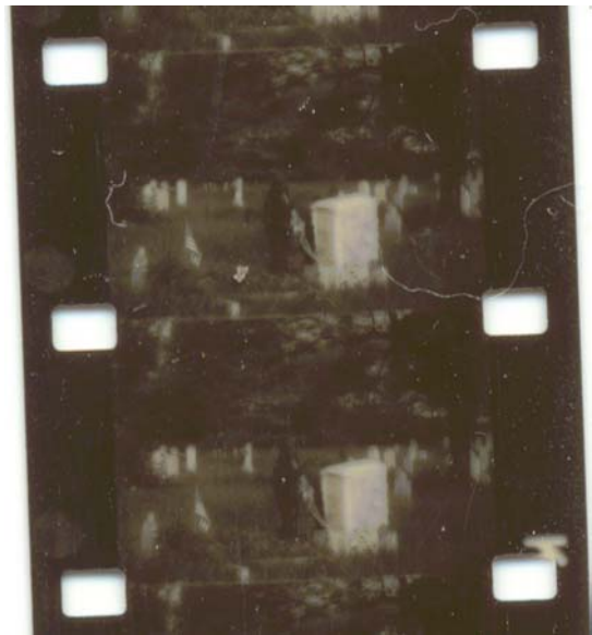
Frames From the Film Showing Wreath Laying at Local Cemetery Before the Day’s Remaining Ceremonies Began

Rudimentary analysis of frames of the film indicate that it documents the day’s events and significant participants in those events. For example, scattered throughout frames of the film are title frames that contain titles of scenes of the documentary. A few of the many titles, by way of example, are: “MEMBERS OF THE POST”; “US ARMY DETACHMENT FOR PELHAM”; “LIEUT VINCENT”, etc. Efforts to match the program of events for the day with frames of the film indicate that each of these titles depicts a portion of the day’s events. For example, Lieutenant J.W. Vincent commanded a detachment of U.S. Regulars from the 18 th Infantry (stationed at Fort Slocum) who marched in the parade sponsored by members of Pelham Post No. 50, American Legion.