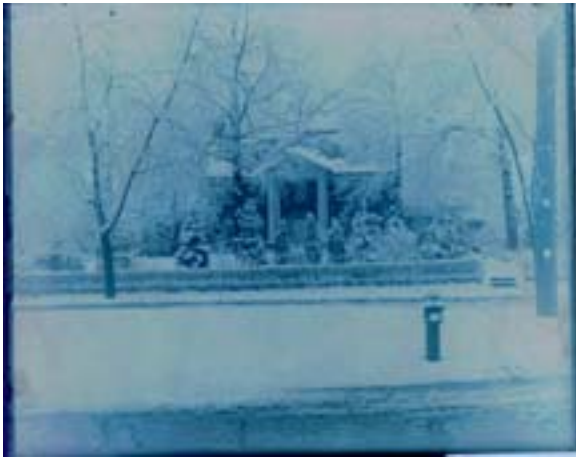
Home at 667 Esplanade After a Snowstorm.