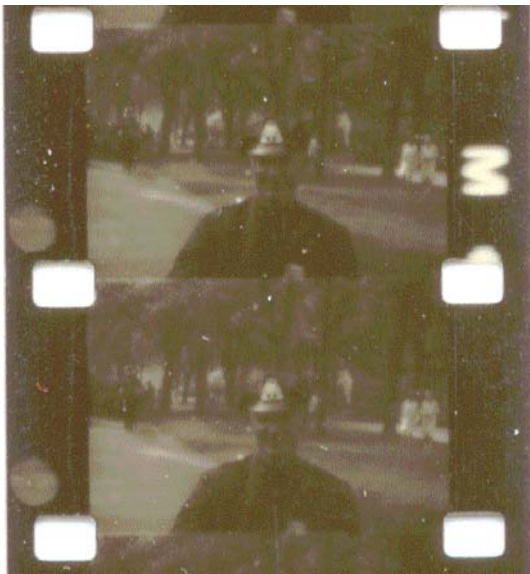
Frames From the Film Showing Pelham Police Officer Standing on the Esplanade with Spectators Strolling in the Background