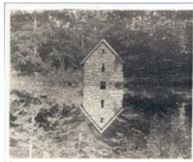
Photograph of Spring and Spring House on Grounds of Bolton Priory, June 19, 1920