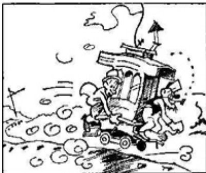
A Passenger Hangs On for Dear Life While "The Skipper" Pilots The Toonerville Trolley